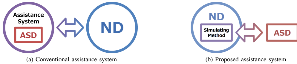
Fig. 1: (a) Conventional method of assisting people with autism spectrum disorder (ASD). The aim is to help ASD people adapt to the normal developed (ND) people’s world. (b) Proposed assistance system that alters the perception of ND people to let them share the same experience as ASD people.